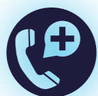
Emergency calls location