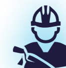
Location of isolated workers to protect them