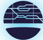
PTC active enabled in depots with poor GPS coverage