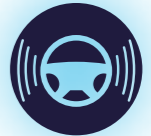
Enabling autonomous driving applications