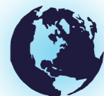
Seamless outside/inside transition

positioning, since spotted default like rail geometry can be precisely located with GPS coordinates, sharable with any GPS-enabled equipment.