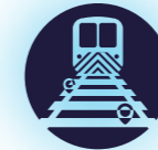
GPS-based Rail Geometry Maintenance